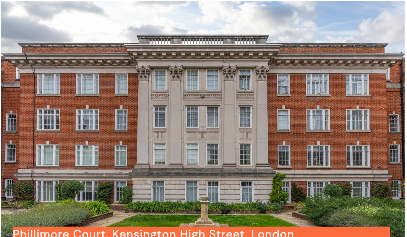
Phillimore Court, Kensington High Street, London